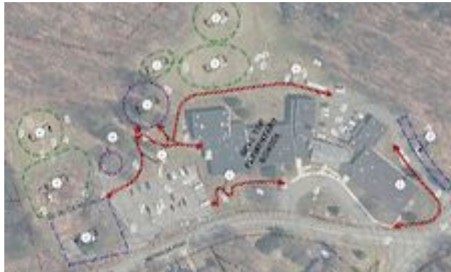
Add and replace walkways, provide additional parking in rear of building, replace existing amphitheater and move it closer to building