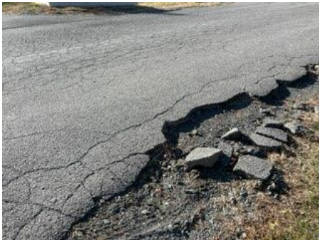
Paving of parking lots and driveways