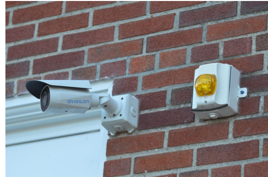
Addition of new security cameras