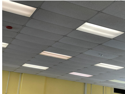
Replace old lights with LED lights