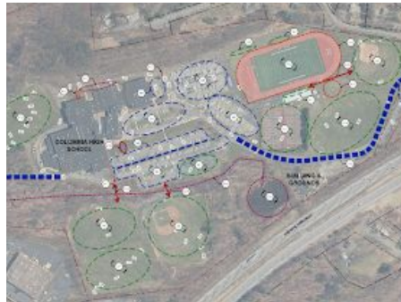
Add and replace walkways for pedestrian safety