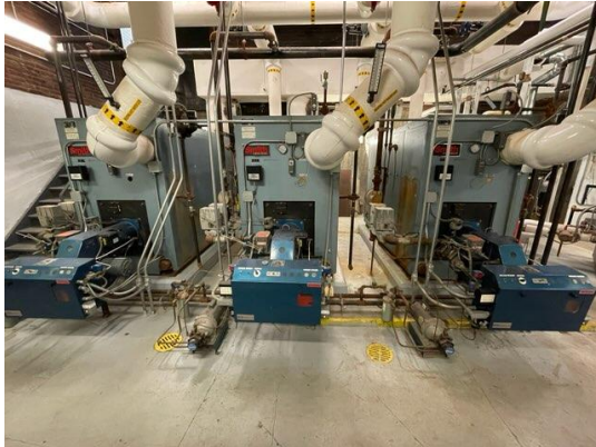
Replace existing boilers