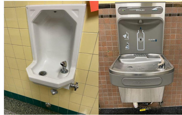
Replace all old drinking fountains