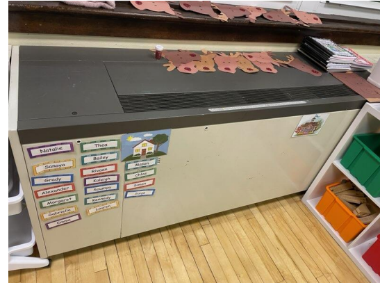
Replace unit ventilators in classrooms