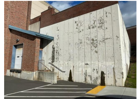
Repair damaged concrete wall at Central Receiving