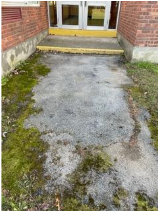
Add ramps for ADA accessibility