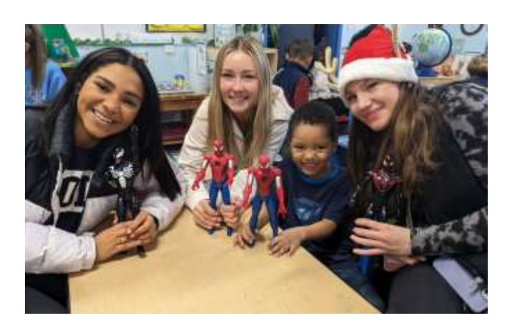
CHS Cheerleaders and Athletes brought holiday cheer to St. Anne Institute.

The Music Department performed at Hawthorne Ridge, at the Train Station and for the Veterans, as well as throughout the East Greenbush District.