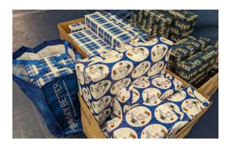
The school-wide Adopt-A -Family program brought a brighter holiday as gifts were distributed to 64 local families

Over the holidays, students and staff once again helped to support Community Programs in need, from Adopt-A-Family to St. Anne Institute to performing for community venues. Math League even created mathematically themed ornaments for a "Geom-A-Tree" and collected for the local food pantry. Great jobs all!